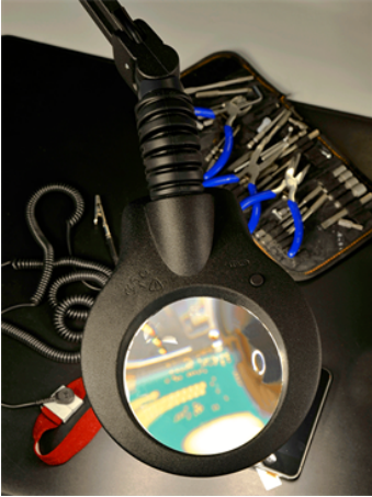
KFM LED ESD