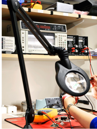
KFM LED ESD