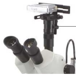
Model ADC25 DIGITAL CAMERA ADAPTER (for small-sized camera)