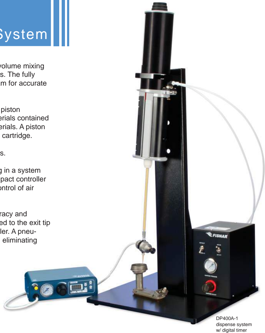
DP400A-1 dispense system w/ digital timer